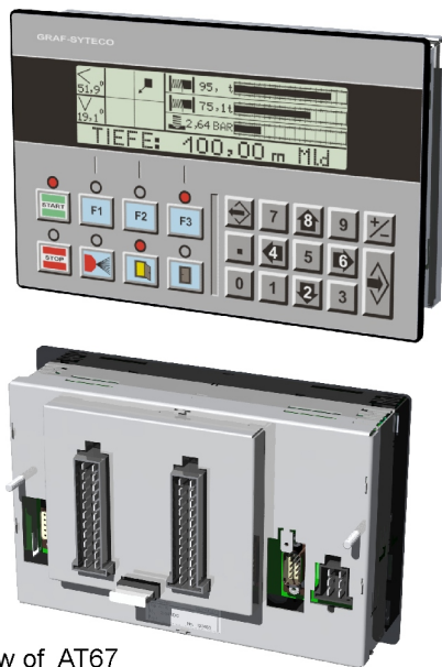
Back view of AT67