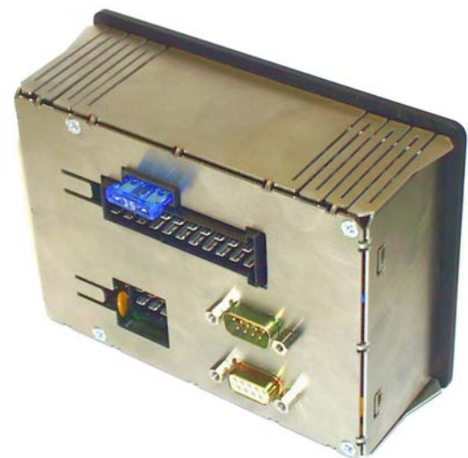
Side view AT37

We reserve the right to make technical alternations without prior notice